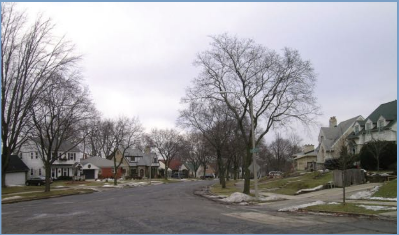
Todays neighborhood-Valley Forge Dr. looking west